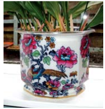
Losol jardinière from about 1900

the £50 to £100 price category, and there are a fair amount of them still around if you look out. The firm's name is clearly marked on the base of the items, not only Keeling & Co – but also Losol ware in a scripted form.